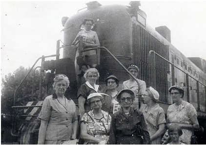
A group of women pose in front of the last passenger train that traveled through Rural Hall on its way to North Wilkesboro, North Carolina, in July 1955.

Last month, we celebrated the arrival of the first passenger train in Rural Hall (June 1888) and this month we mark the last passenger train that departed our town (July 1955). If you would like to learn more interesting facts about trains - and the Rural Hall Depot in particular - please attend our next Open House on Saturday, July 17, from 11 AM until 2 PM . We would love to show you around! Admission is free; donations appreciated. See you at the Depot!